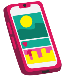
SOCIAL MEDIA CAMPAIGN 3-5 posts for Instagram/TikTok