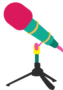
FUTURE INTERVIEW Podcast/video with someone from 2050

Pick one of your crazy ideas from box 4, in this box draw or describe what the city you live in would look like in the year 2050, if your crazy AI solution had been invented.