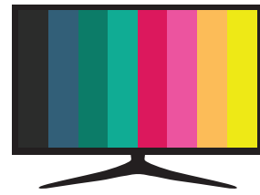
TV/VIDEO ADVERT 60-90 seconds