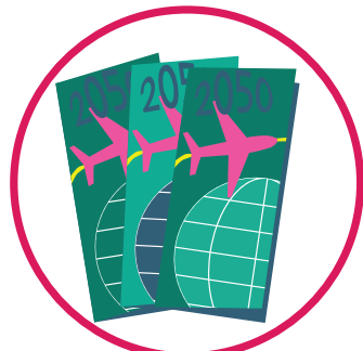
TRAVEL BROCHURE Digital 2-4 pages