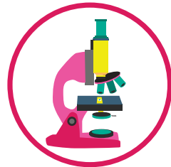
FUTURE OF LEARNING